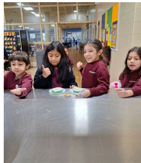
Club members on their first day