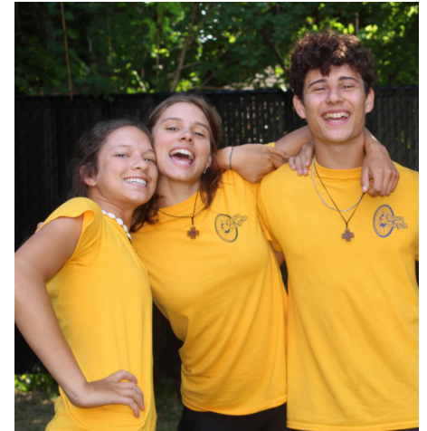
Bosco Bicycle participants

Both types of ministries, school and parish, are wonderful experiences. They both help young people in different ways and challenge our personal growth in holiness.