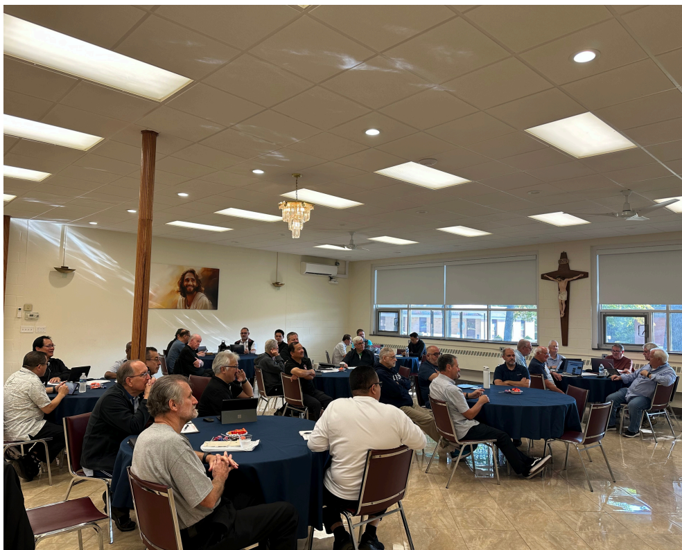
Salesians from the SUE and SUO Provinces gathered at the National Shrine of Mary Help of Christians in Stony Point, NY.