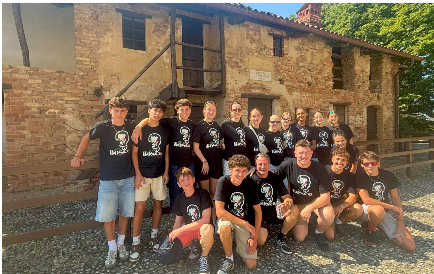
Le Salesien students visit the house where Don Bosco grew up (top photo) and his final resting place (bottom photo) during their trip to Italy.