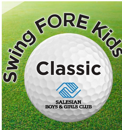
Part of the promotional image for this year's "Swing FORE Kids"

(East Boston, MA – August 20) – The Salesian Boys & Girls Club's 7th Annual "Swing FORE Kids" Golf Tournament will take place on Monday, September 29, at the Winthrop Golf Club in Winthrop, MA. The Club invites everyone to join them for this wonderful opportunity to support its mission of enhancing the lives of children and families.