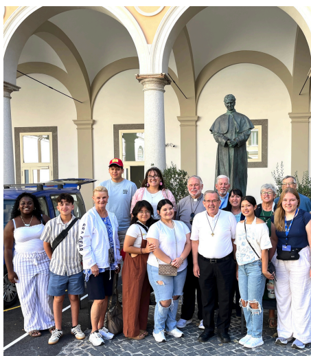
CRTSHS family with the Rector Major (center right)

beloved Don Bosco, not only into the man, but also the saint.