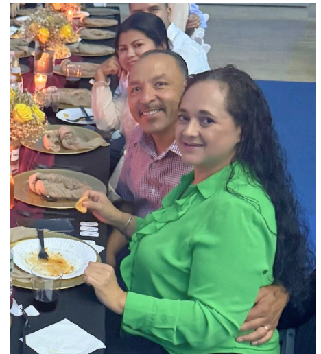
Salesian Family dining at the province's inaugural Latin Night