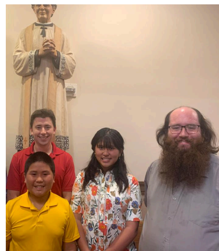
MHC Parish's music ministers and sacristan-altar server

The next three Sundays will be "Recognition Sundays" to recognize and honor the MHC Divine Mercy Society and the Rosary Guild. On these Sundays, the members will receive their membership pins and outreach packets.