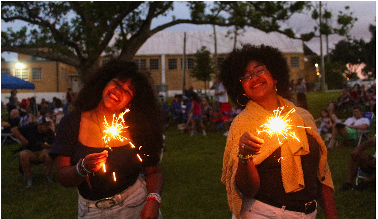
Tampa Salesian Family celebrates the Fourth of July with sparklers