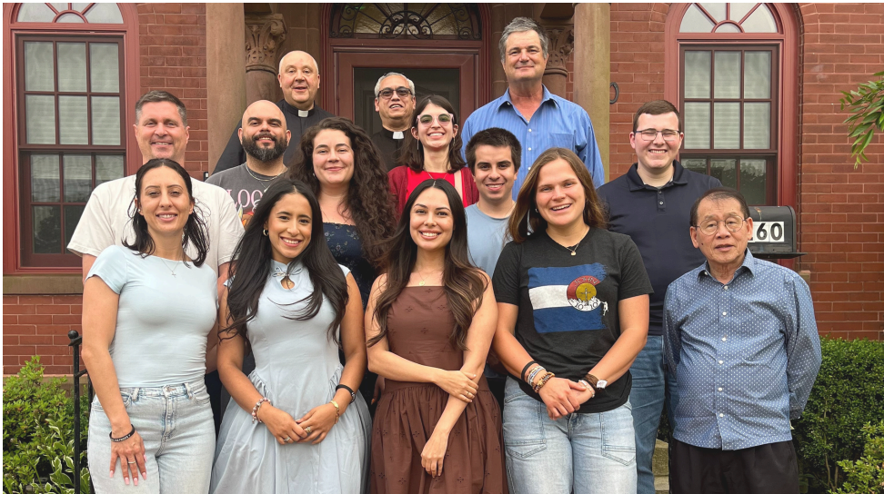
Port Chester Salesians and SLM candidates from the most recent discernment weekend

A NEWSLETTER FOR THE PROVINCE OF ST. PHILIP THE APOSTLE