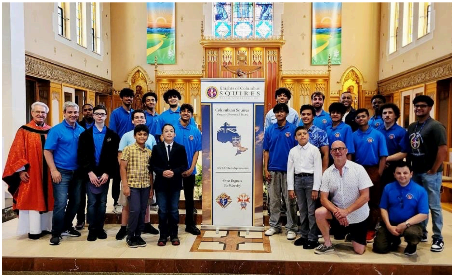
St. Benedict Parish Salesian Family, including its local Columbian Squires circle, St. Dominic Savio Circle #5217