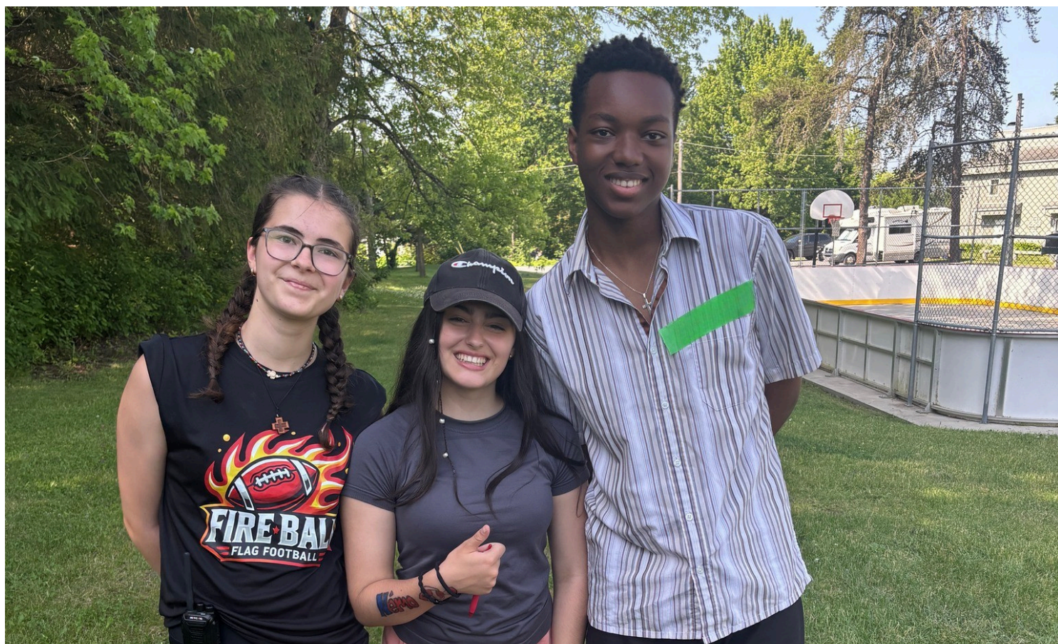
Three of the 32 young campers at Camp Dominique-Savio in Sherbrooke, QC