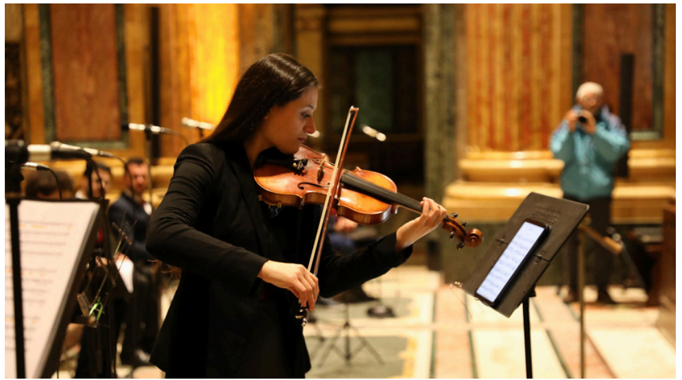
A violinist performs during the Salesian Family Spirituality Days celebration in Valdocco, Turin, Italy

Don Bosco knew how to bring to life the energy of hope on two fronts in his life: 1.) the commitment to personal sanctification and 2.) the