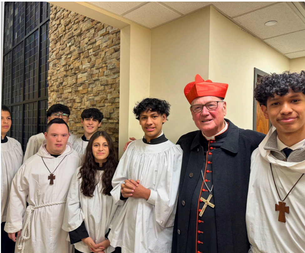
Cardinal Timothy Dolan and altar servers at the Mass for the inauguration Mass of the National Shrine of Mary Help of Christians

Need a date added? Let us know by emailing us at communications@salesians.org .