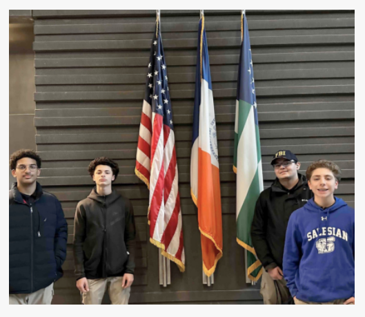
Salesian High students and members of the FBI explorer program

These students took on law enforcement challenges at the FBI Explorer program competition, where they faced lifelike scenarios from traffic stops to domestic disputes. Although they competed against larger groups, Salesian High students dipped their toes into the experience and showcased determination and courage.