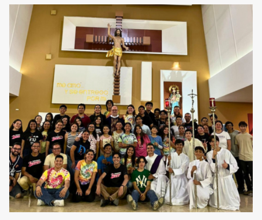
Lenten retreat for all groups of the Salesian Youth Movement of the Oratory of San Javier