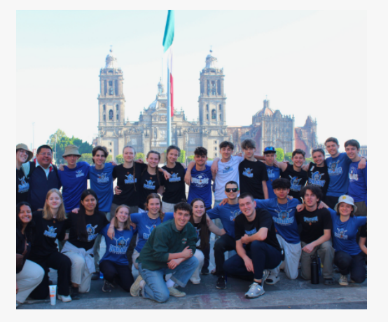
JMS members during their mission trip

Since they are about my age but have lived three times my life, these young people have an almost supernatural force inside them. This perhaps explains why they get up every day with a huge smile stamped on their faces. From my first steps on Mexican soil, I realized that, even if these children had had one-thousandth of the opportunities we have, they were a thousand times happier.