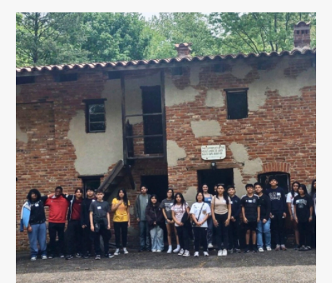
A visit to the Becchi House is a stop for every person on a youth retreat. This provides them with an opportunity to discuss Don Bosco's Dream of Nine Years Old in the setting of the room where the dream happened.

We've identified and overcome challenges that have stifled our ability to reach more young adults. In collaboration with the Archdiocese of New York, we will create a young adult