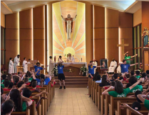
Friday Mass with campers at Happy Days Camp in Montréal