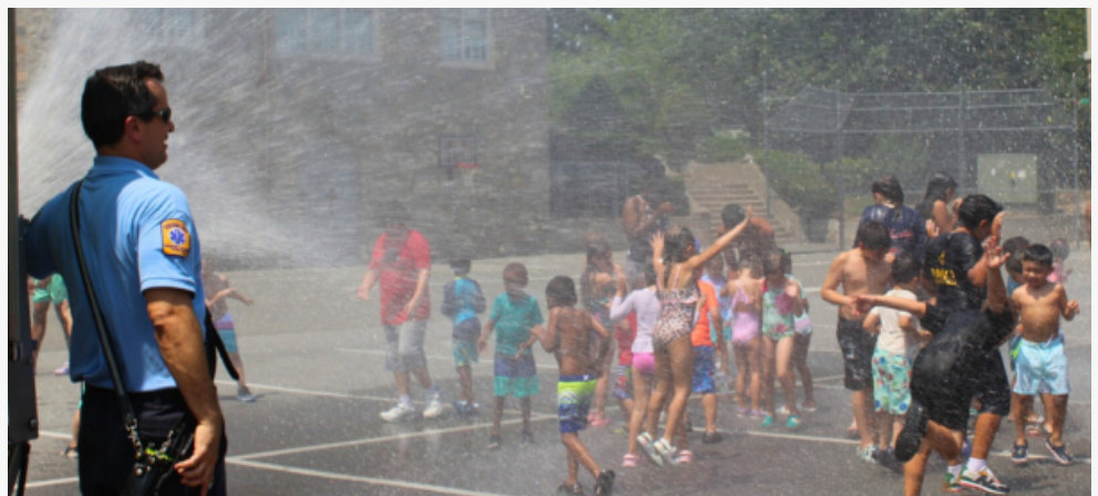
A New Rochelle firefighter releases water for children at Camp Echo Bay to cool off during a hot summer day

Salesian Family Festival Q&A sheet, the links of which can be fully accessible via the link on page 2 Created by Sr. Denise Sickinger, FMA