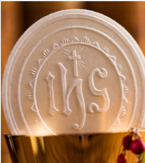
The Eucharist, the Sacrament of Presence