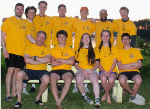
Staff and campers of Bosco Bicycle in Sherbrooke