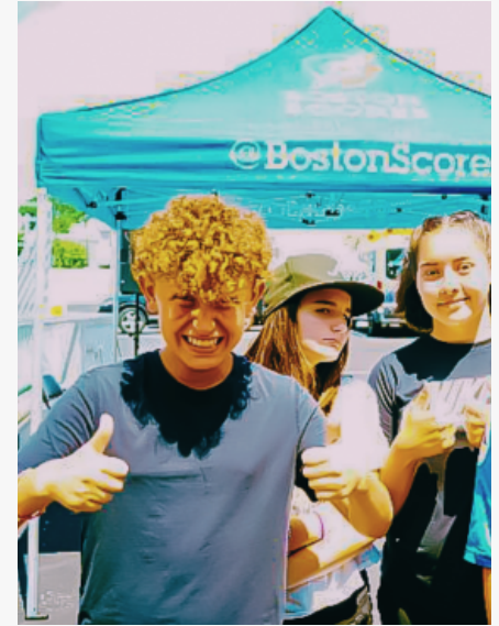
Young people at the ribbon-cutting ceremony