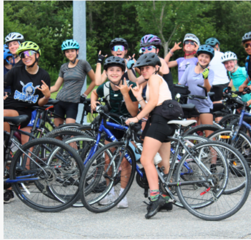
Bosco Bicycle campers