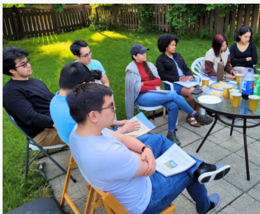
Animation team during the session for Hearts Present and Joyful

Latino Family Day and an afternoon of entertainment and food together.