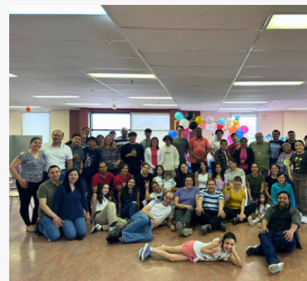
Animation team after completing Hearts Present and Joyful