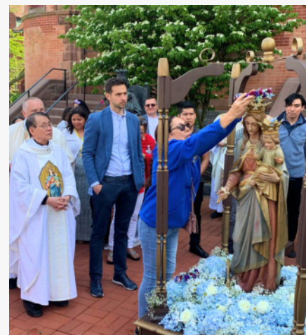
Crowning of Mary Help of Christians in Port Chester