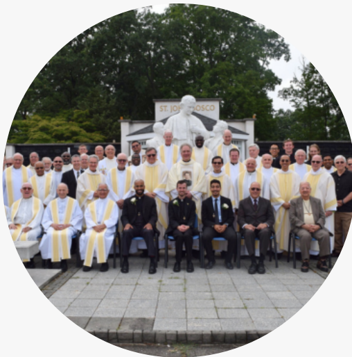
Salesians after the Mass of Perpetual Profession, August 2021