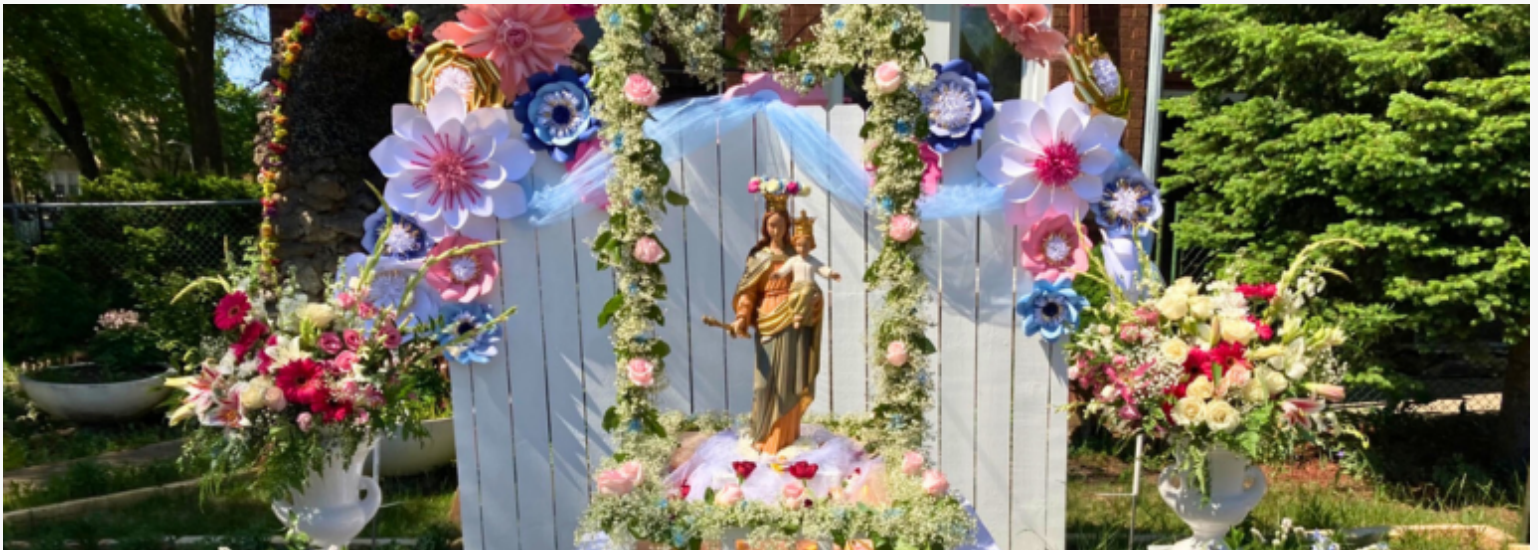
Crowning of Mary Help of Christians at la Fiesta Maria Auxiliadora in Chicago