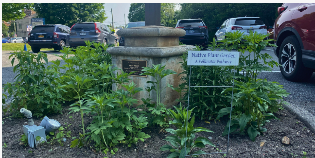
Crucifix Garden at Salesian High School