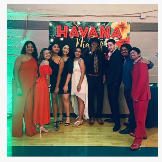
Students at this year's Don Bosco Gala

This year, we are being invited to focus