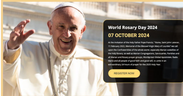
Promotional image for World Rosary Day