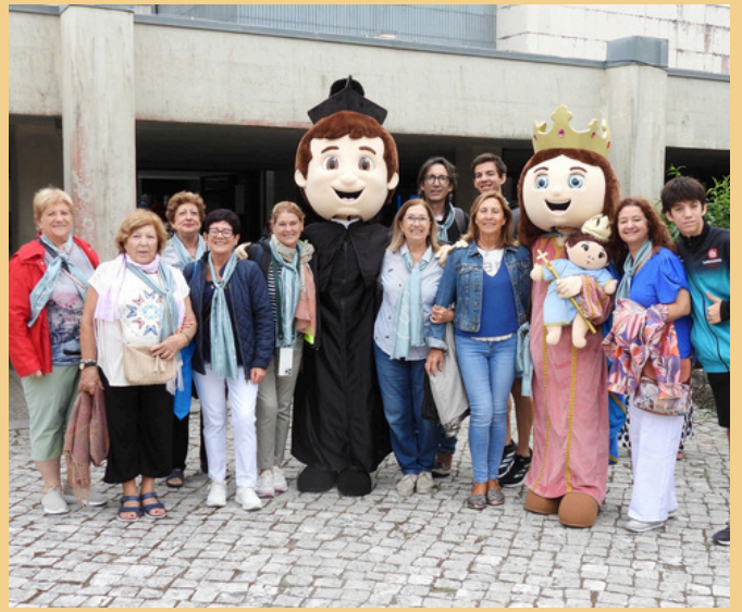
Salesian Family with "Don Bosco" and "Mary Help of Christians" in Fatima