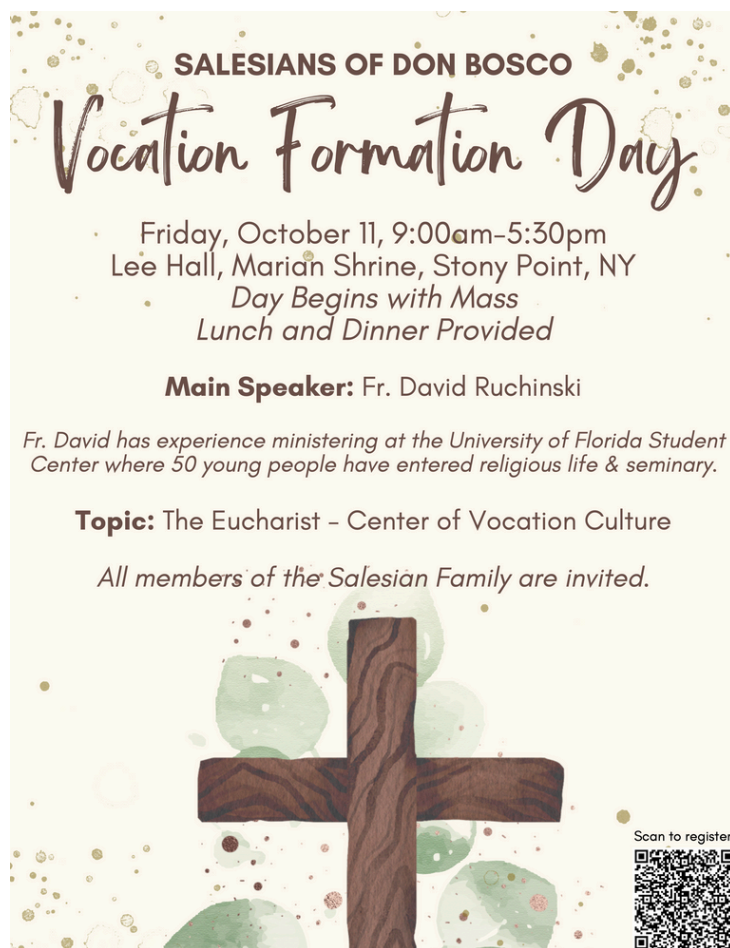
Advertisement for Vocation Formation Day