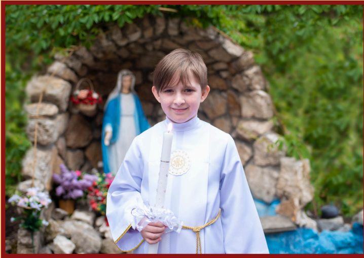
A boy about to make his First Communion stands in front of a Marian grotto holding a candle.