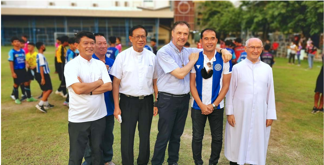
The Rector Major during his time in Thailand