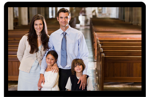
Family in church

Reading this chapter made me reflect on how God waits with great patience for each one of us to come back to Him whenever we sin. The document points out the gradualness of pastoral accompaniment, of listening to the other so as to become familiar with his/her story and situation. It is only then that a suitable and charitable accompaniment toward the fullness of the truth can take place. While respecting the truth, the Holy