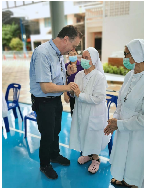
The Rector Major with Salesian Sisters in Thailand

The Salesian house is an opportunity that transforms lives, that performs real "miracles." Yes, I repeat the word: real