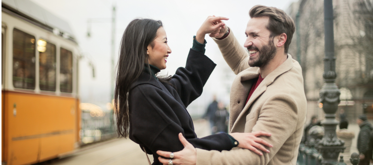
A happy couple dancing on the sidewalk